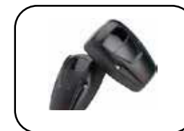
Tau Photo Beam Dectect